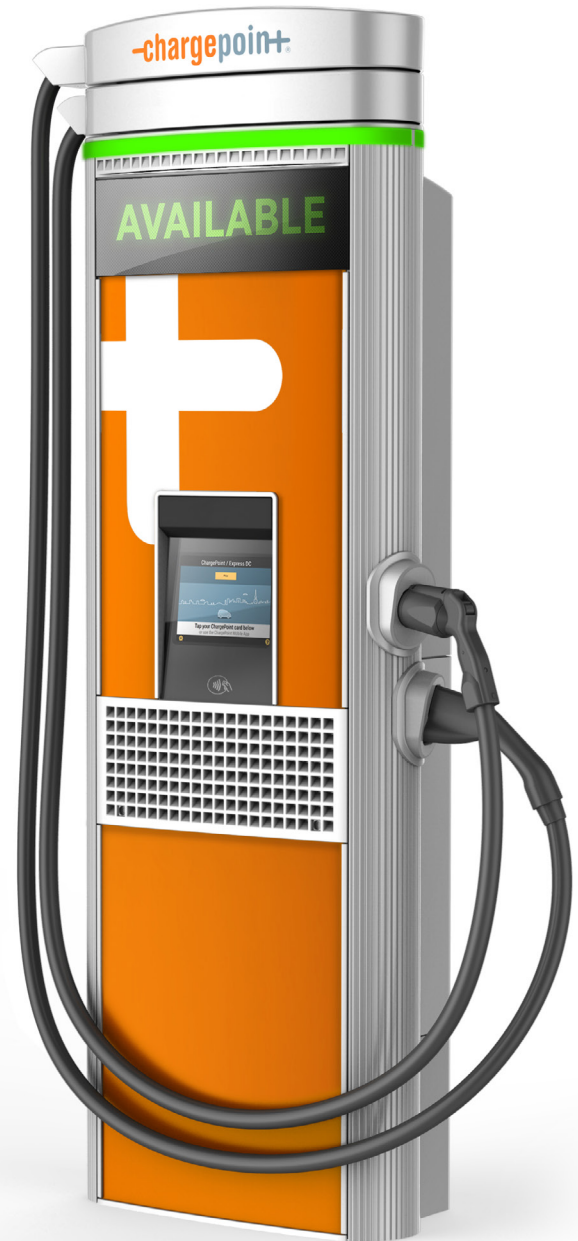
Express 250 Station